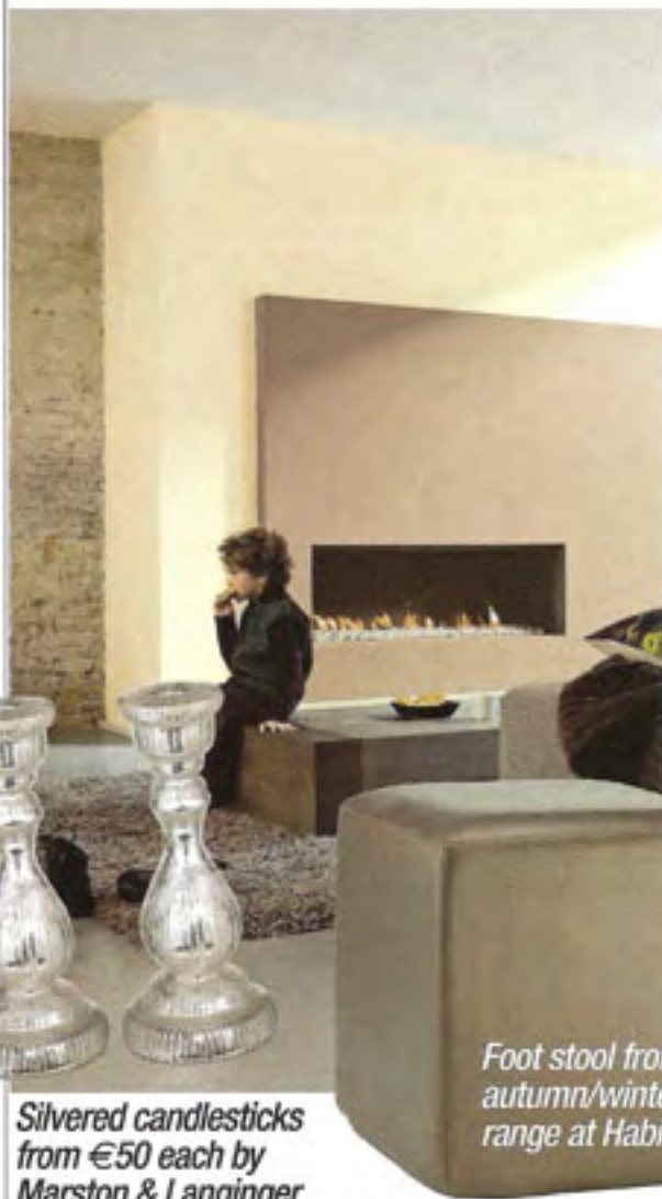
Silvered candlesticks from €50 each by Marston & Langer